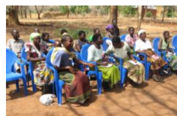
We sponsored a seminar last month on teaching adult literacy. One of the participants has already started holding classes three days per week!