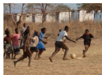
Boys & girls playing football together in youth group