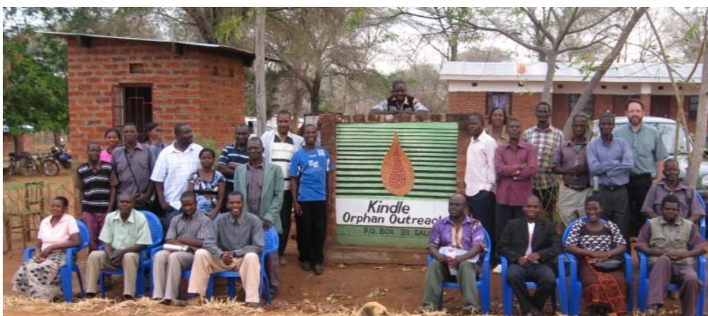
Most of the full-time Kindle staff members were present here at our last staff meeting. This staff is often supported by short-term volunteers.

When I started exploring Kindle in the middle of this year, the thing that impressed me were the projects —in this age when everyone likes to call things “holistic,” I saw something that really was.