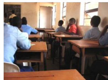
At a local secondary school I was sad to see a classroom with no textbooks—just one empty desk after another! We have a volunteer (below right) at the school assisting in a few subjects.